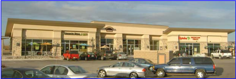
The Culinary Multiplex Building Einstein Han Noory Anthony's Qdoba Bagels Sushi Cafe Pizza