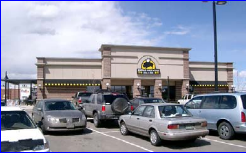
Buffalo Wild Wings