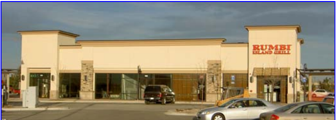
The Longmont Galleria Building Heidi's Deli T3 Wireless Rumbi Island Grill